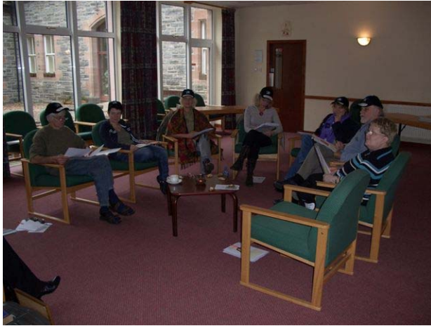
Team Building at Fairburn

comfort zone and encouraged them to cooperate with one another in team settings in order to win a prize – a bar of chocolate!