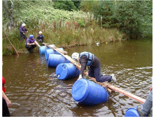
Client Activity - The Winners!

We also organised a Confidence and Communication event which was aimed at encouraging clients to learn appropriate communication methods which employers would look for in a workplace and how to put their point of view across clearly and concisely when challenged or under stress. This provided an excellent platform for clients to share experiences both good and bad and learn from each other in a safe environment. We are happy to report that from both of these events, new friendships have formed and clients who did not know each other before are now mutually supportive and encouraging of one another.